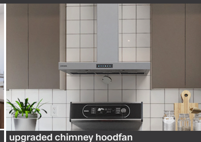
upgraded chimney hoodfan