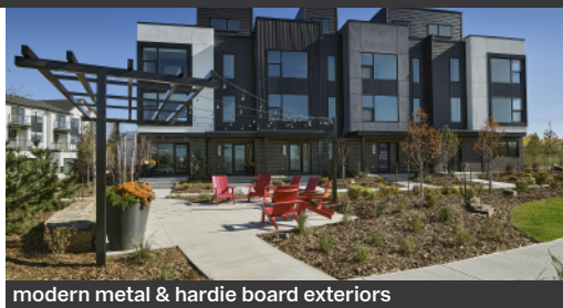
modern metal &amp; hardie board exteriors