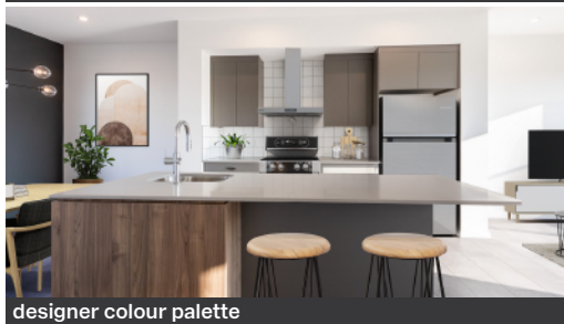
designer colour palette